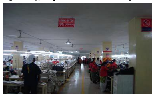
[Sewing Department Overview]