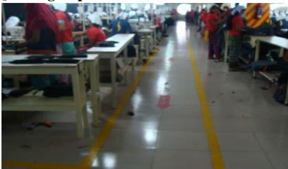
[Sewing Department Overview & aisles mark]