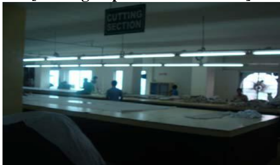
[Cutting Department Overview]