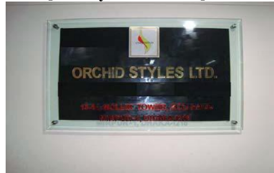
[Factory Name Board]