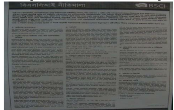
[Posted BSCI Code of Conduct]