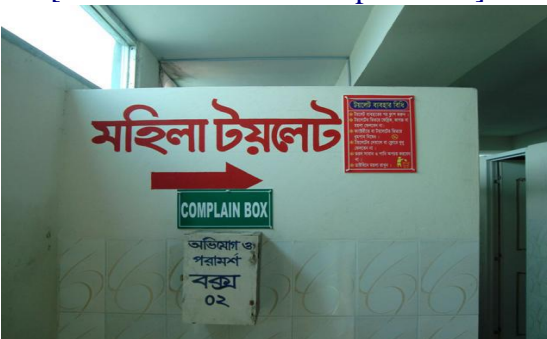
[Female toilet with complain box]