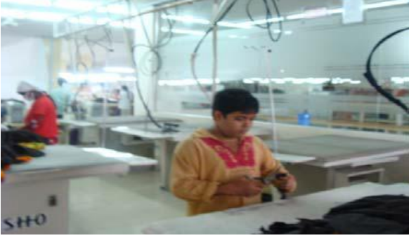
[Ironing Department Overview]